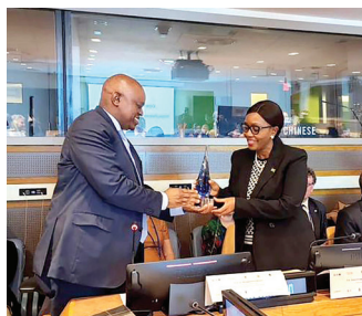
H.E. Saara Kuugongelwa-Amadhila , Prime Minister of the Republic of Namibia on behalf of H.E. Hage Geingob, President of the Republic of Namibia