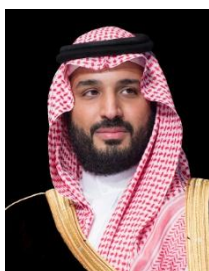
H.R.H. Prince Mohammed bin Salman Al Saud Crown Prince & Prime Minister, Kingdom of Saudi Arabia