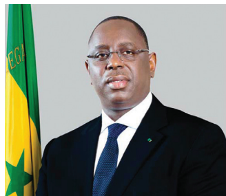
H.E. Macky Sall , Co-Chair. President of the Republic of Senegal. Chair: African Union