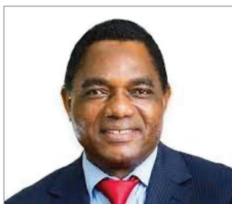
H.E. Hakainde Hichilema , President of Zambia