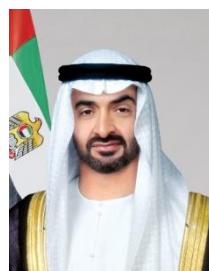
H.H. Sheikh Mohamed bin Zayed Al Nahyan President – United Arab Emirates