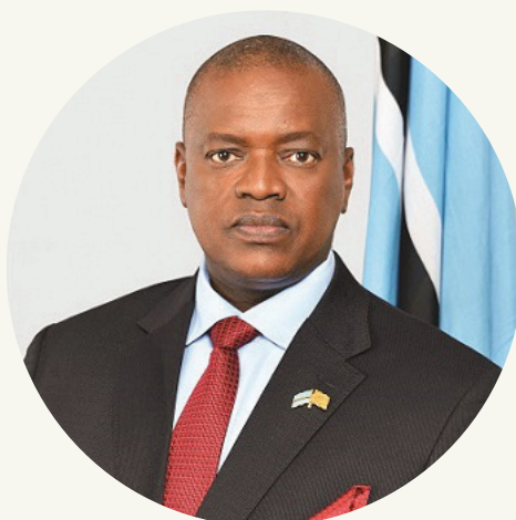
H.E. Dr. Mokgweetsi Eric Keabetswe Masisi