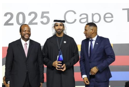
H.E. Sheikh Shakhboot bin Nahyan Al-Nahyan Minister of State on behalf of H.H. Sheikh Mohamed bin Zayed Al Nahyan , President of the United Arab Emirates