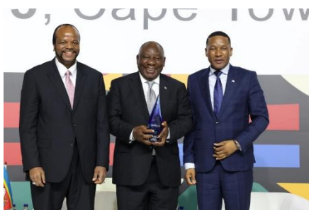
H.E. Cyril Ramaphosa President - Republic of South Africa, Chair-G20