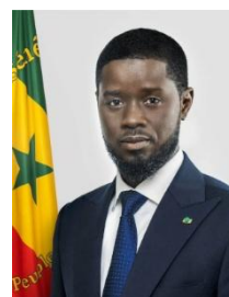
H.E. Bassirou Diomaye Faye President – Republic of Senegal