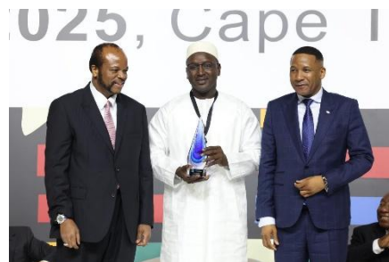
H.E. Dr. Cheikh Tidiane Dièye Minister Water and Sanitation on behalf of H.E. Bassirou Diomaye Faye , President of the Republic of Senegal