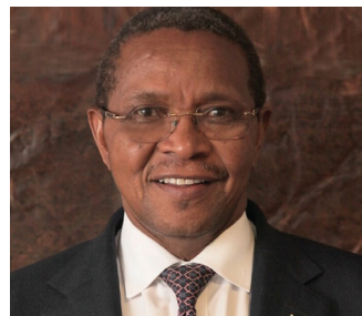
H.E. Jakaya Kikwete , Alternate Co-Chair. Former President of the United Republic of Tanzania