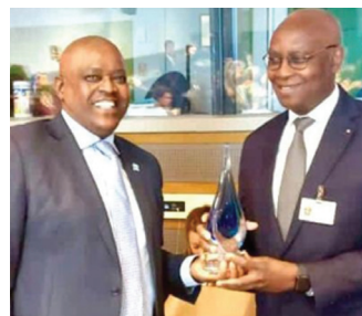
H.E. Serigne Mbaye Thiam , Minister of Water and Sanitation on behalf of H.E. Macky Sall, President of the Republic of Senegal