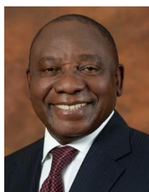
H.E. Cyril Ramaphosa President Republic of South Africa