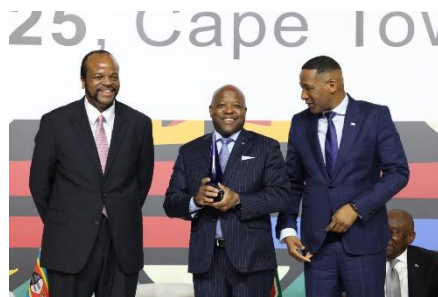
Hon. Mhlomi Moleko , Minister of Natural Resources and Energy on behalf of H.M. King Letsie III , King of the Kingdom of Lesotho