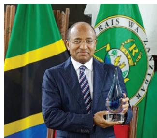
H.E. Hussein Mwinyi , President of Zanzibar