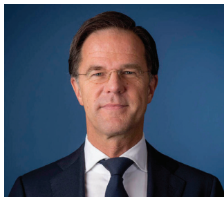
H.E. Mark Rutte , Co-Chair. Prime Minister of the Netherlands