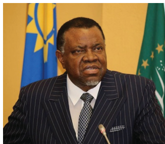
H.E. Hage Geingob , Co-Chair. President of the Republic of Namibia