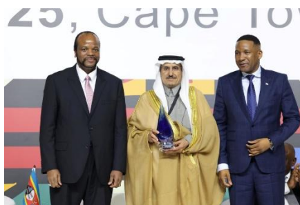
H.E. Dr. Abdulaziz Alshaibani , Deputy Minister for Water, on behalf of H.R.H. Prince Mohammed bin Salman Al Saud , Crown Prince, Prime Minister of Saudi Arabia