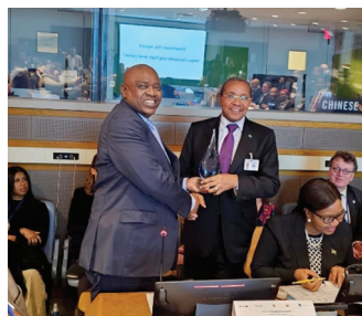
H.E. Jakaya Kikwete , Alternate co-chair of the High-Level Panel, Former President of Tanzania