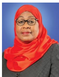
H.E. Samia Suluhu Hassan President United Republic of Tanzania