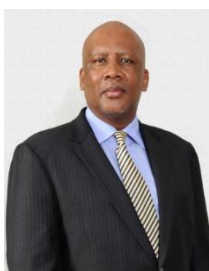
H.M. King Letsie III Kingdom of Lesotho